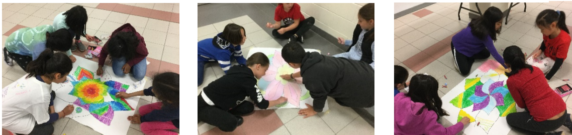
Students creating Rangoli art in celebration of South Asian Heritage Month.