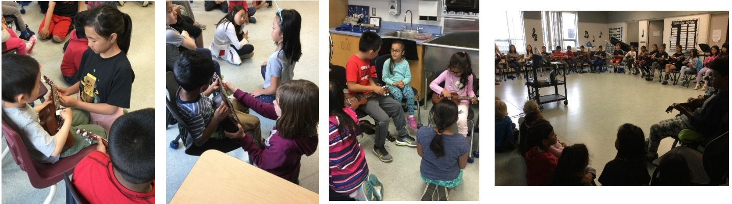
Grade 4 students teaching Kindergartners how to play the ukulele

The grade 8's are also in the process of picking their valedictorians for their graduation ceremony. On Thursday the students nominated different nominees to later be voted for in a short list. The nominees will have to prepare a speech to present in front of all grade 8's to persuade them for their vote.