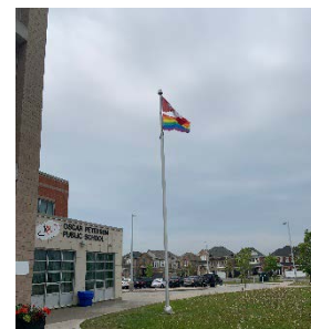
Flying the Pride Flag at OPSS